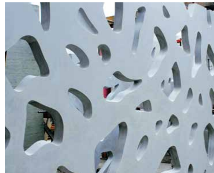
The CHRYSO Dem Range of release agents delivers the desired surface finish for precast concrete elements.