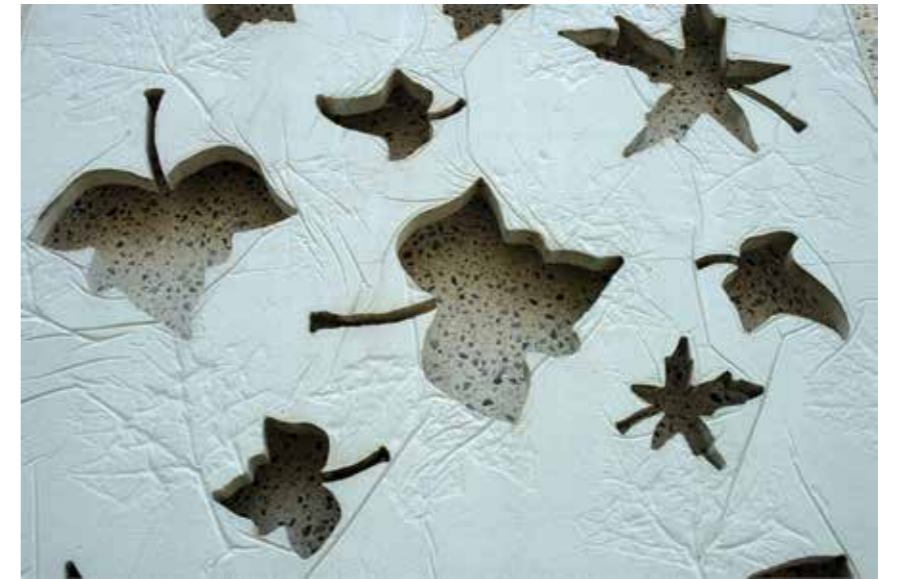
Demoulding oils, if used when casting concrete, will raise the quality of finishes and extend the life of formwork

“These release agents deliver the desired surface finish for the precast concrete element,” he notes. “In the case of timber shuttering or formwork, it also reduces the loss of water from the concrete, due to absorption by the shuttering or formwork.”