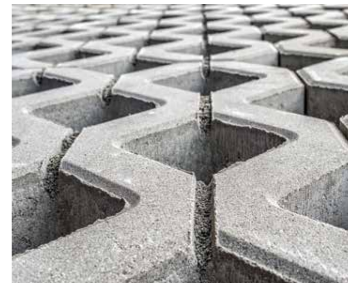
Demoulding oils (release agents) permit easy removal of formwork